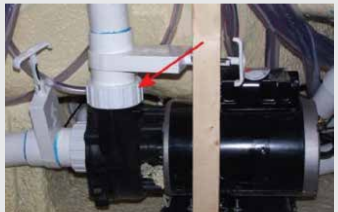
FIGURE 1.9b : PUMP UNION; LOOSEN UP TO BLEED AIR