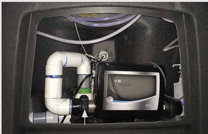
FIGURE 1.9a : HEATER UNION; LOOSEN UP TO BLEED AIR